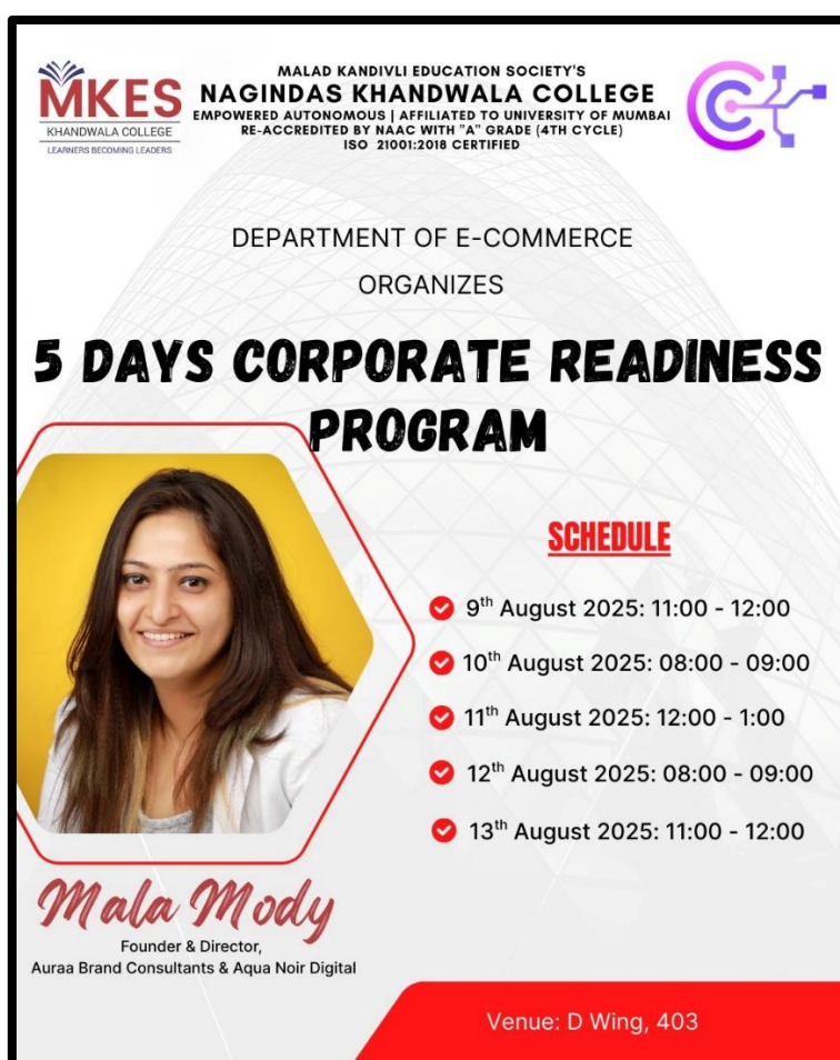
Poster of the event